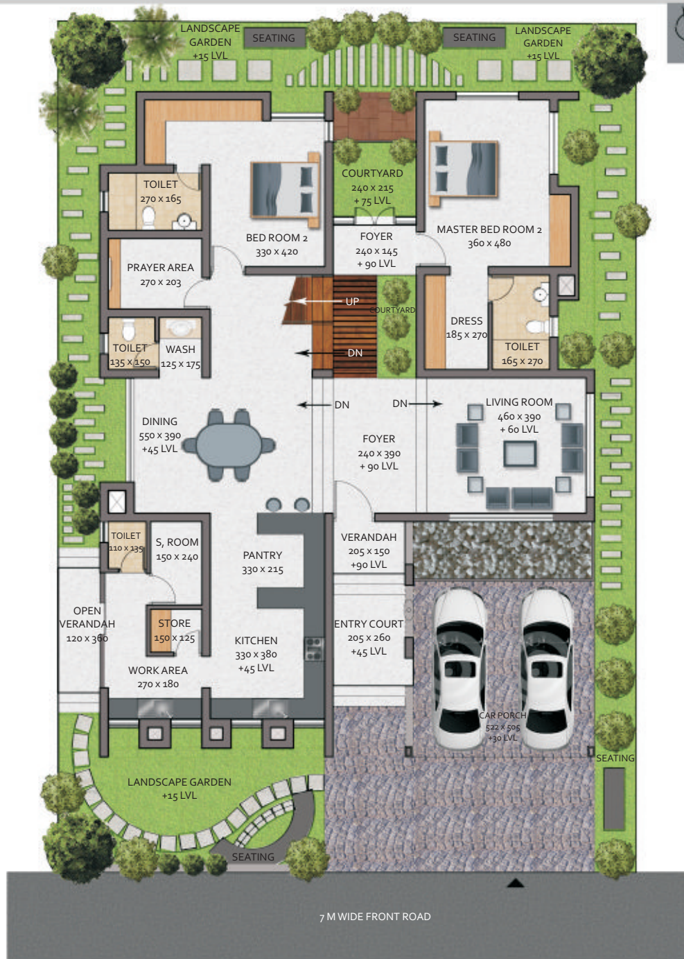
Option 2 A - Ground Floor Plan

Plot Area : 10.1 Cents Plinth Area : 2513.63 Sq.Ft