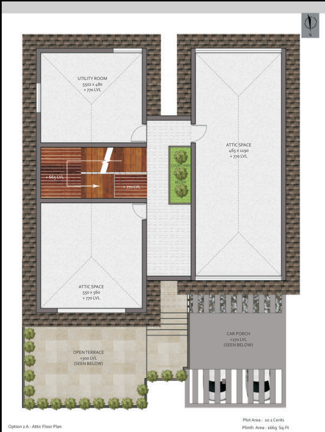
Option 2 A - Attic Floor Plan

Dimensions may vary during construction/ furniture and fixtures are indicative only/ all dimensions in centimetres.